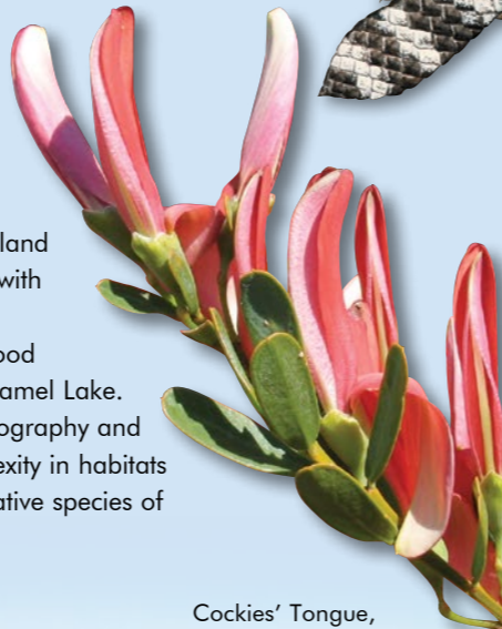
Cockies' Tongue, Templetonia retusa

Banksia and Tuart woodland covers most of the park with outcrops of species rich Limestone Heath and Flood Gum Wetland around Camel Lake. The vast variation in topography and aspect leads to a complexity in habitats supporting over 1000 native species of flora, fauna and fungi.